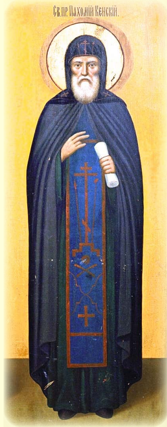
St. Pachomius, Abbot of Keno Lake Monastery