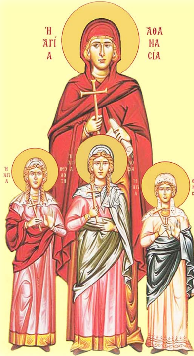
Holy Martyr Athanasia and her three daughters, Theodota, Theoktiste, and Evdoxia.