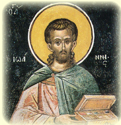
Holy Unmercenaries Cyrus and John