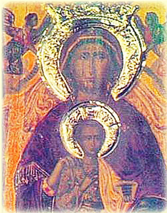
Synaxis of the “Koroniotissa” or “Dakryrousa” Icon of the Most Holy Mother of God