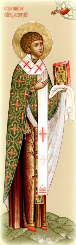
St. Nicetas of the Kiev Caves, who became Bishop of Novgorod