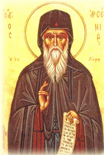
St. Arsenios the New of Paros