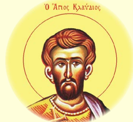
Holy Martyrs Diodoros, Tryphaina and Claudios