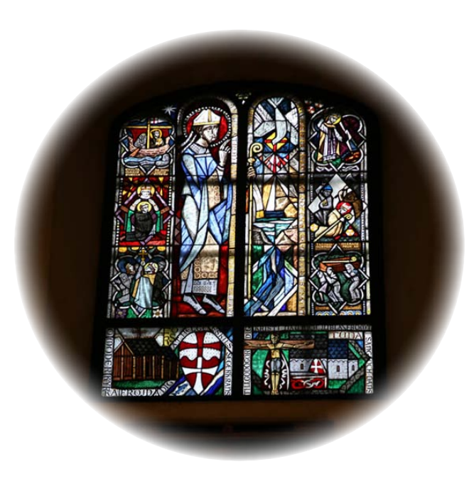
A stained glass window depicting scenes from the life of St. Eskil, in Fors Church, Eskilstuna.

Mother Magdalene and Sister Lydia Convent of St. Philothei