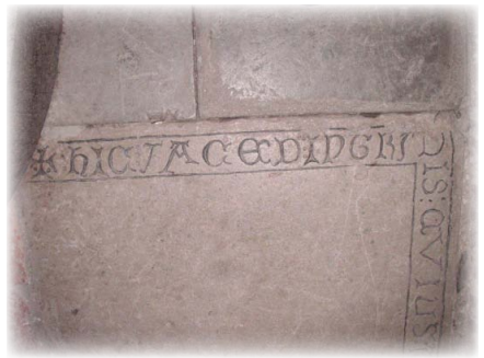
An Abbess' gravestone

The nuns were divided into "choir sisters" and "lay sisters." The former seldom left the convent and mostly occupied themselves with daily prayer, whereas the latter did more practical tasks and worked outside on the convent grounds, for example in their large apple orchard. They had the right to interrupt their work to perform the seven canonical hours of prayer outside of the Church.